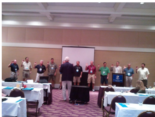
Incoming 2011 Board