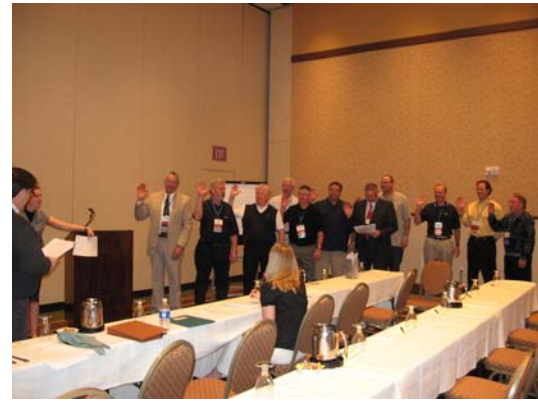
Board Members are sworn in for 2007.